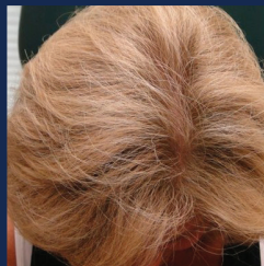
After 2 Months