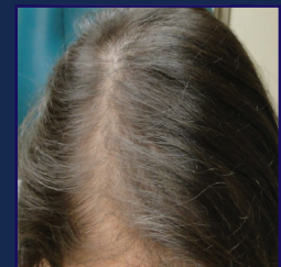
After 4 Months