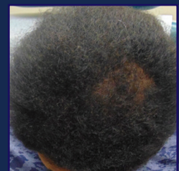
After 4 Months