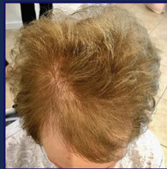
After 3 Months