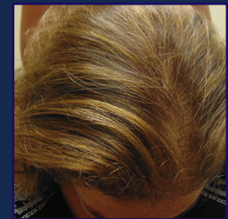
After 4 Months